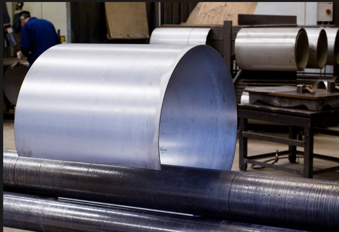
Steel sheets being rolled into tubes.